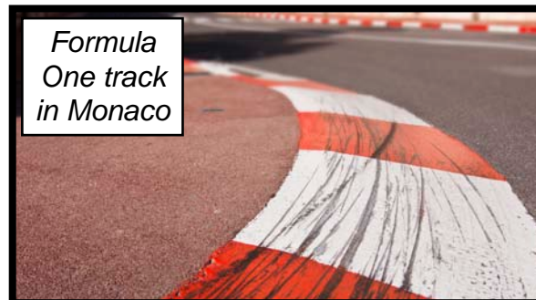
Formula One track in Monaco

Motorsports, including Formula One and motorcycle racing, are also very popular.