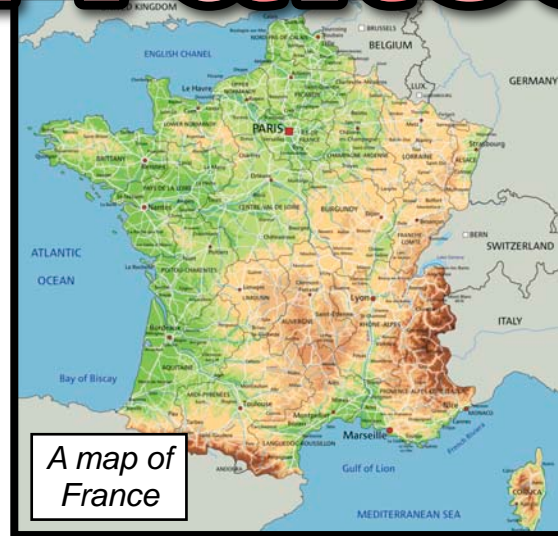
A map of France